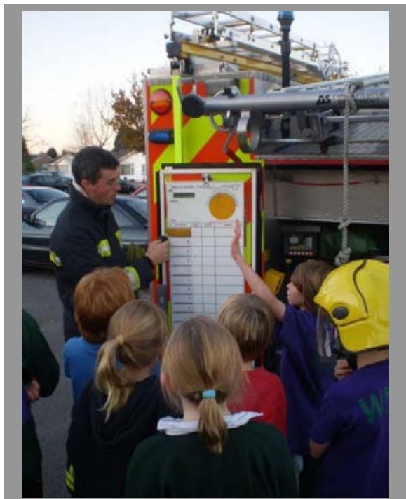
Above: The children got a good chance explore the Fire Engine and ask lots of questions!